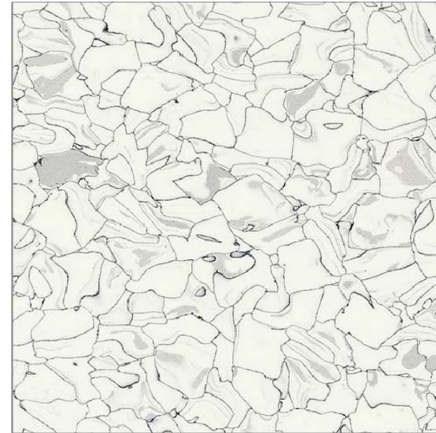
Top View of H 24 Panel